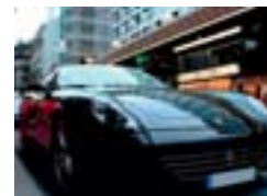
Locate your car