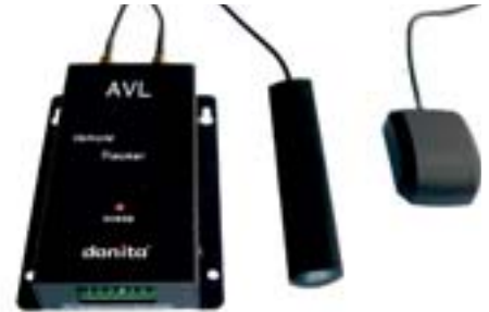
Complete set with main unit and antennas for GPS and GSM.