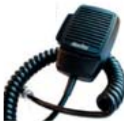
Microphone 4 pin f/danita 310M Item No. 463