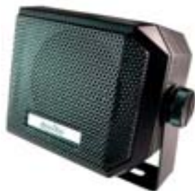
Speaker Standard 8 Ohm, 4 W 220 cm wire and JP3 jack 75x75x40 mm Item No. 332132