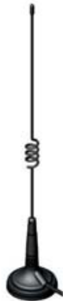
CB Magnet Antenna 49 cm, 1/4 wave 4,9 m cable, UHF connector. Pre-adjusted for CB band. Item No. 34162