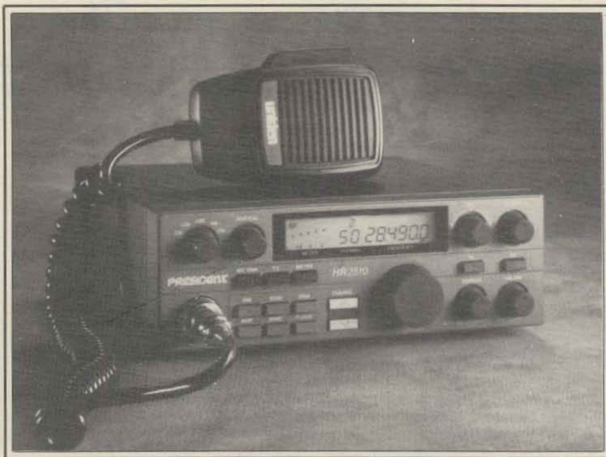
Uniden's new HR-2510 is a compact, all-mode 10 meter transceiver with a sensitive receiver and 25 watt output transmitter.

The compact HR-2510 is enclosed in a black and dark gray cabinet measuring 2½" H x 7¼" W x 11"D, and weighs roughly 4 pounds. The front LCD readout is amber color, with selectable bright or dim backlighting. Its left side includes bar-graph metering, and the right side indicates frequencies. A stout internal speaker is mounted on the bottom, and a healthy heat sink on the rear is flanked by connectors for antenna, power, and accessories. Rather than using regular ½ inch phone jacks, Uniden's 2510 has one nine-pin Molex socket for connecting a key, external speaker, and auto PA speaker. Switching from internal to external speaker and/or connecting a key thus